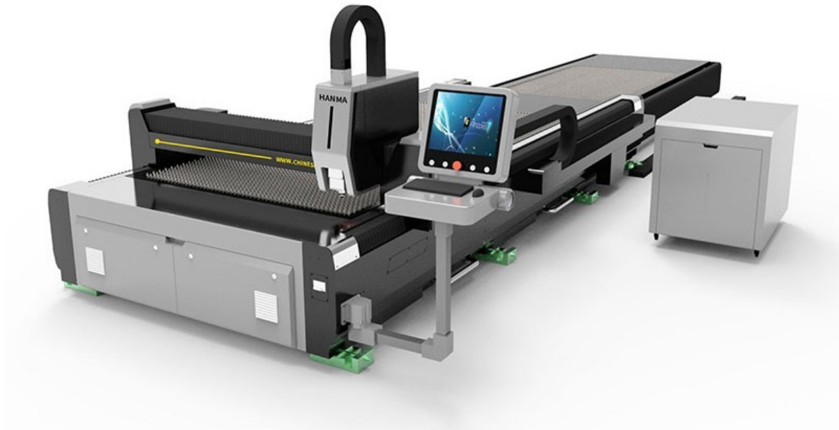
Laser cutting machine

Laser cutting aluminum plate also depends on the power of the laser generator. The thickest one can be cut, and it can be cut, but the processing cost is high, because it is a highly reflective material. Laser cutting uses a focused high-power density laser beam to irradiate the workpiece. The irradiated material is rapidly melted, vaporized, ablated or reaches the ignition point, and at the same time, the molten material is blown away by the high-speed airflow coaxial with the workpiece, so as to realize the cutting of the workpiece.