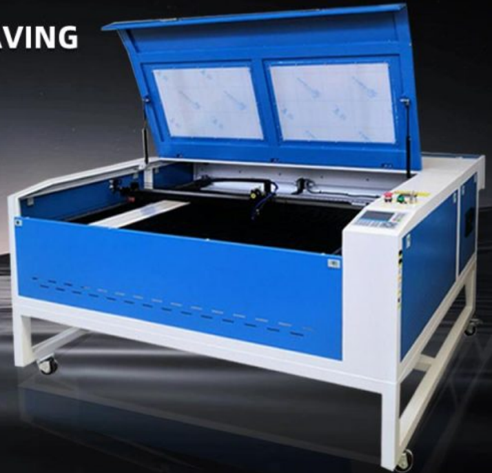
laser cutting machine